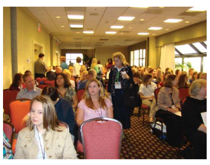
Attendance was good at the 16th Annual TASP Professional Conference in San Antonio