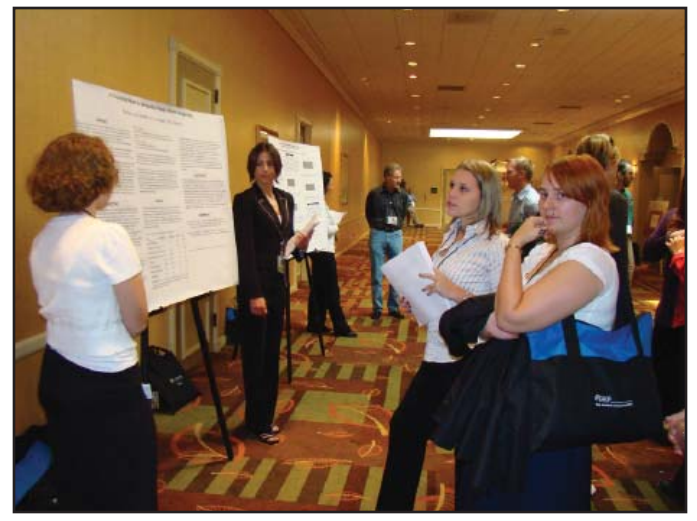
TASP members peruse the research at the Poster Session.

The presenter offered a warning that, in her opinion, if examiners only use the CHC model with intelligence and achievement scores, they may miss important information in determining the cause of their client's difficulty. She advocated "playing detective" by reviewing the information presented in interviews, observations, and behavioral rating scales and linking the things found in those with the patterns of strength in weakness in cognitive ability as shown by the IQ and Achievement test scores. She then suggested that the examiner establish a preliminary hypothesis and follow up by investigating that with further assessment measures.