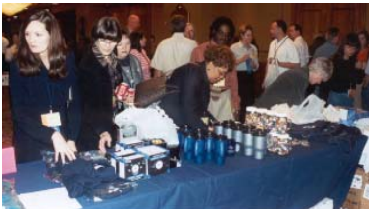
Conference attendees enjoy shopping at the TASP memorabilia table