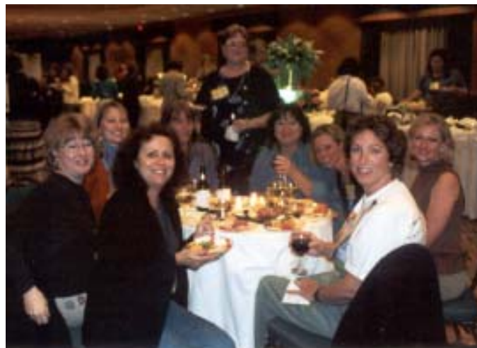
Conference attendees enjoying the fellowship of their colleagues at the President's Reception on Friday evening.