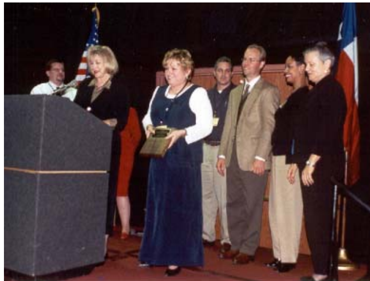
The Psychological Department of the Galena Park I.S.D. receives the award for Outstanding Delivery of School Psychological Services to a School District.