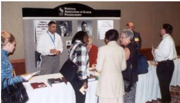
Conference attendees visit the many exhibits in the Exhibit Hall at the Annual Conference.