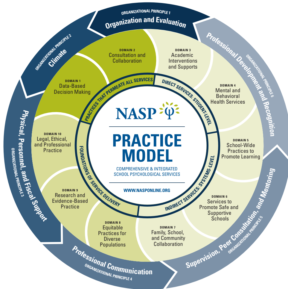
Figure 1. The NASP Practice Model

The Model for Comprehensive and Integrated School Psychological Services (the NASP Practice Model) describes the services provided by school psychologists to students, families, and schools. The model generally does not differentiate the services provided by school psychologists prepared at the doctoral and specialist levels. Rather, the model promotes a high level of services to meet the academic, social, behavioral, and emotional needs of all children and youth. It may be noted, however, that work experience, advanced graduate education, and professional development may result in specific skills and advanced knowledge of individual school psychologists. Among groups of school psychologists, not everyone will acquire skills to the same degree of proficiency across all domains of practice. However, all school psychologists are expected to possess at least a basic level of competency in all of the domains of practice described in this model.